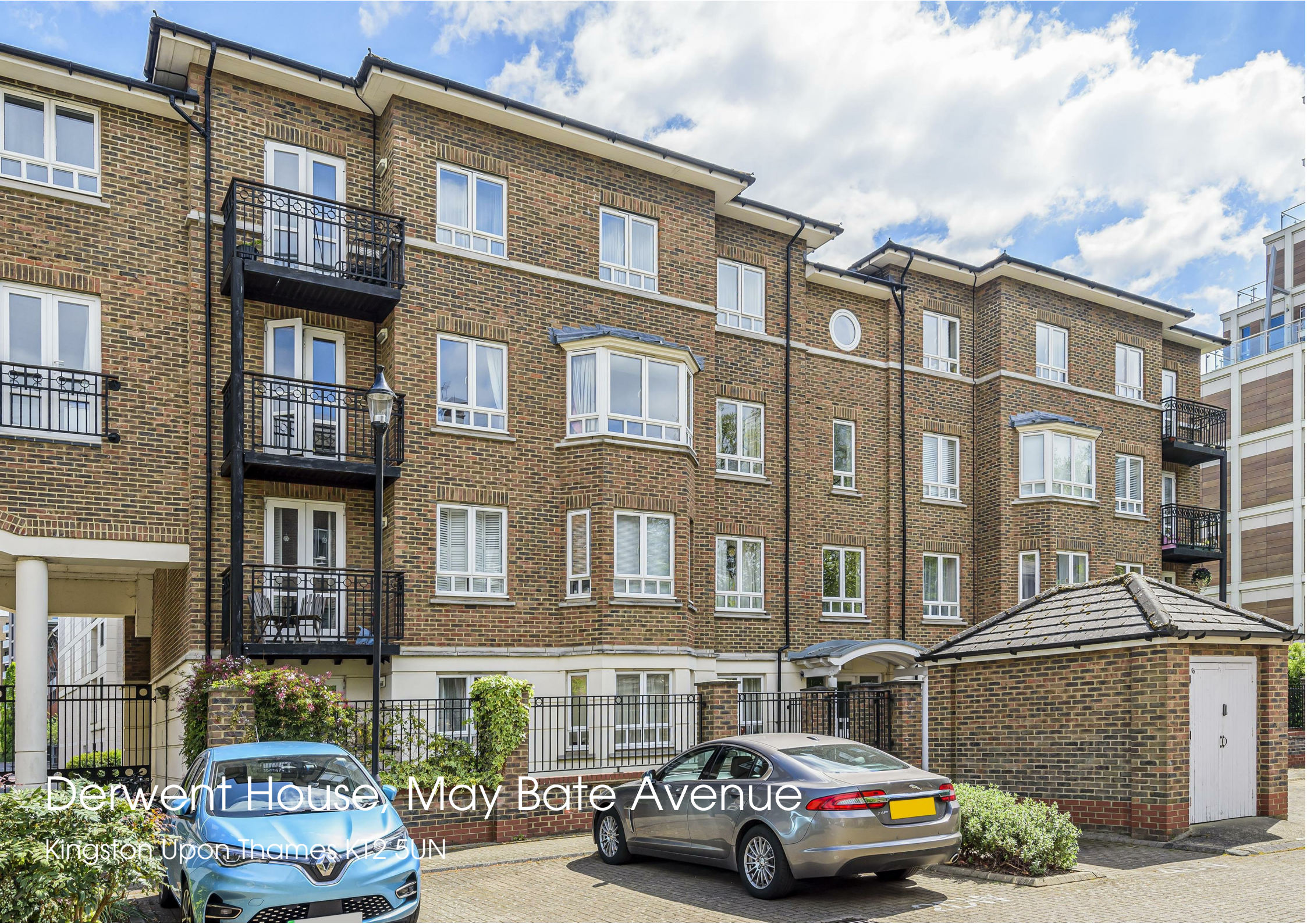
Derwent House, May Bate Avenue Kingston Upon Thames, KT2 5UN